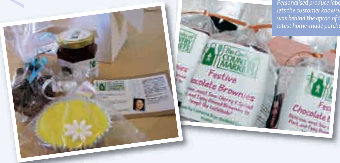
Personalised produce labels lets the customer know who was behind the apron of their latest home-made purchase

"How much you sell can vary from week to week, but so far I've made a profit from doing something I love which is great!"