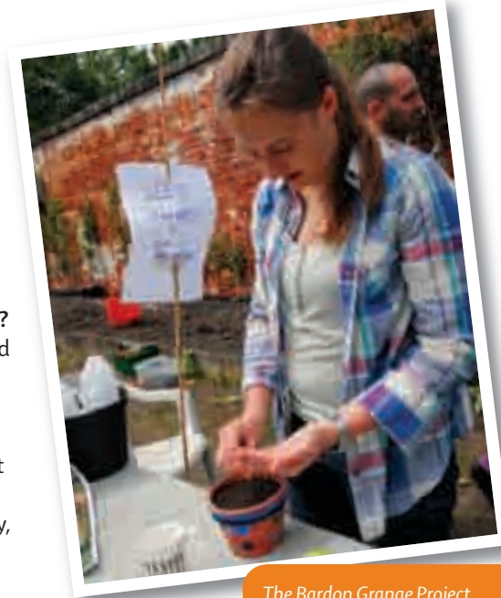
The Bardon Grange Project, University of Leeds

This guide will tell you more about how you can be involved with a community food enterprise at your university, as well as who to go to for help and support.