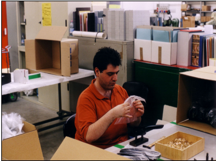
Assembly work at Cooperativa Giovani Rilegatori , social cooperative

The Type B co-op we visited was Giovani Rilegatori , a co-op print shop set up in the early 1980s to do printing for other co-ops, which transformed itself in the 1990s into a Type B social coop. In addition to its professional printing of co-op annual reports, it provides work for the handicapped by taking in low skill, labor-intensive print work and by adding light assembly work. While we visited, several severely handicapped workers were putting together seat adjustment levers for Alfa Romeo. This co-op has 17 working members, 45% in the disadvantaged category. It recently moved to a modern industrial park, its building purchased with a 50 year, 2% interest loan from the Imola's local development fund. It's hard to beat – if you believe in an ownership society for those who otherwise are left out of ownership like unskilled women in home health care and the disabled.