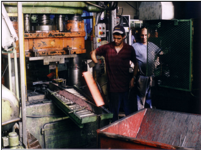
Running a forge press at Zappettificio Muzzi, the worker cooperative agricultural implement company

It was shut by its conventional owner in 1981 but bought and reopened by 25 employees who used their severance – Italy, like most European countries, has a general system of severance pay – for the purchase.