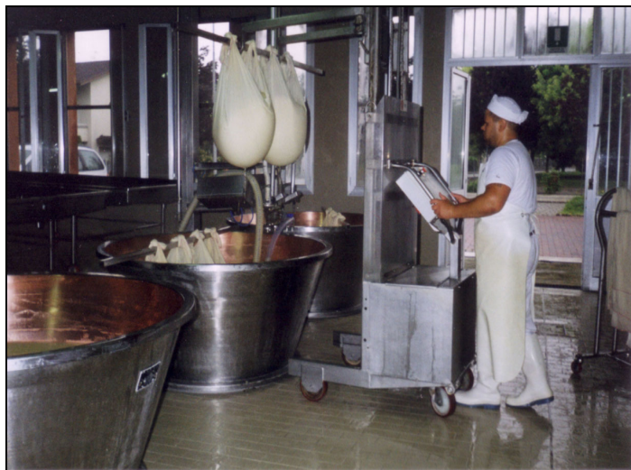
Forming parmigiano reggiano at Latteria Sociale

The agricultural processing co-ops we visited pooled the production of very small producers.