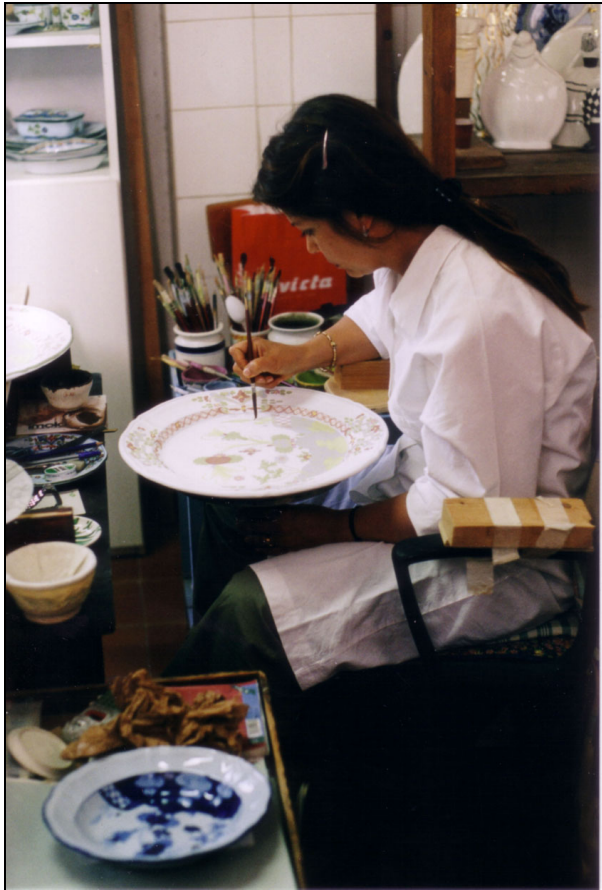
Artist at work at Cooperativa Ceramiche, Imola

Most employees aren't co-op members in this firm. Of 1350 employees (40% women), only 172 are members of co-op -- mainly in the production departments -- and only 10% of these are women. To be eligible for membership requires a minimum of five years of employment, a positive job review, and values compatible with those of the co-op. It also requires a willingness to pay a high membership fee: $112,000, payable over time, and the membership fee is revalued annually to adjust for inflation. Interest on the membership fee is currently 9%, and patronage dividends for members run about 30% of annual salaries. The membership fee is returned at retirement.