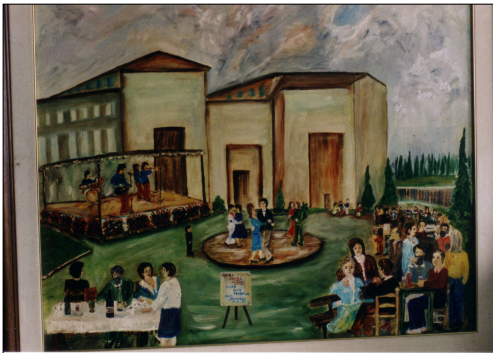
Co-op member's painting of Cooperativa Bilanciai summer employee party

It has become a major innovator technologically, introducing the first electronic scales in Italy and the first European calibration lab. The plant is similarly modern with robots doing the welding for truck and platform scales. The company spends 7% of revenue on R&D, a remarkably high number in a mature industry.