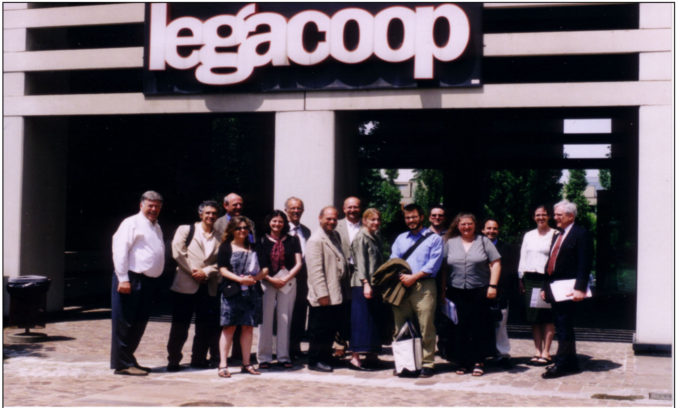
The CCT group at Legacoop

[1] There are three main cooperative federations: Legacoop, the Communist/Socialist group; Confcooperative, the Catholic federation; and the Associazione Generale, the far smaller, Social Democratic group. All three organize co-ops in all sectors including employee-owned firms, consumer coops, credit unions, agricultural coops, housing co-ops, etc. While the political labels still have some residual meaning, they have lost their Cold War importance, and some of the co-ops belong to both the Communist and the Catholic federations.